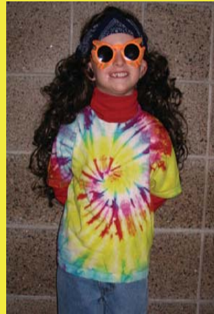
Hunter dressed up as a hippie on the Flower Power Non School Day.