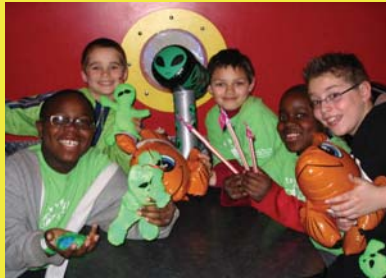
Older Kids Club at Space Aliens